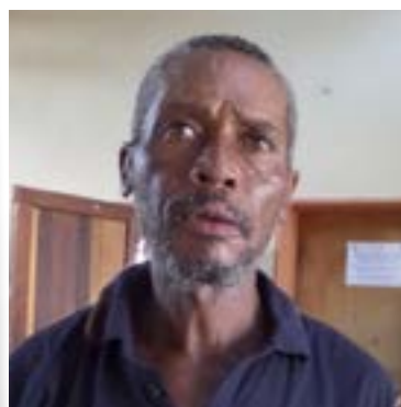
France – K2